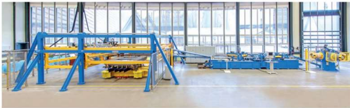
Core cutting line type CCM 650 CSEC-4000