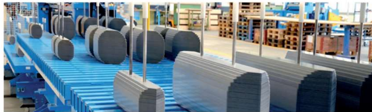
Pin stacking system CSD5-1600