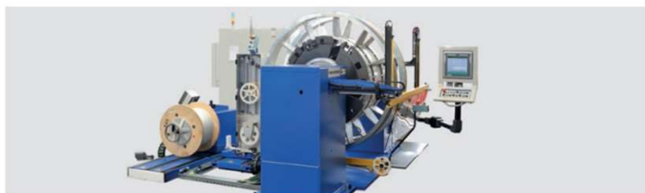
MRI coil winding machine type SCWM 1500

MRI winding machines: The machines are used to wind the MRI coils with sensitive supra conductor at highest accuracy.