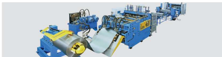
Corrugated fin panel production line type TFF5 1600-400